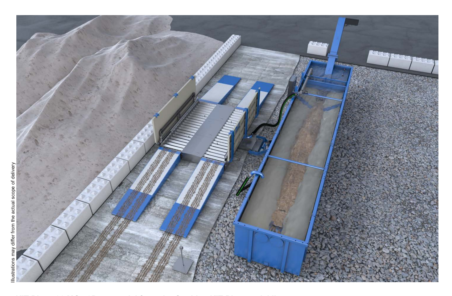
KIT Plus 400 MC-50P – a model from the ConLine KIT Plus model line

Mobile, hot-dip galvanised, water-bearing wash unit with splash guard walls, pump sump tank, recycling tank with scraper conveyor, pump technology, solid concrete ramps, and a control system.